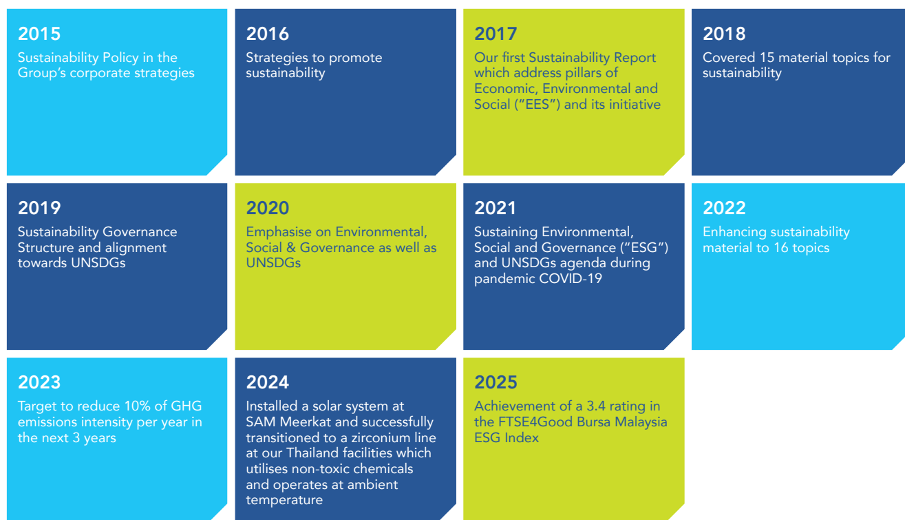
Figure 1: Sustainability Milestones

SAMEE Group has made significant progress in our sustainability journey over the past few years, setting ambitious goals in FY2023 to reduce 10% of GHG emissions intensity over 3 years from FY2024 to FY2026. The Company has launched several initiatives to enhance our Economic, Environmental, Social and Governance performance and operational sustainability. These include solar panel installations, rainwater harvesting, operational efficiency measures, a carpooling system, recycling programmes, and the introduction of a Zirconium line in our Thailand operations. SAMEE Group is also committed to enhancing employee safety through continual policy improvements, such as the Restriction of Hazardous Substance ("RoHs") Policy and the Employment Policy. We experienced significant growth in our sustainability efforts and sustainability milestones in FY2025 and we will continue to prioritise our commitment to sustainability as we grow and innovate.