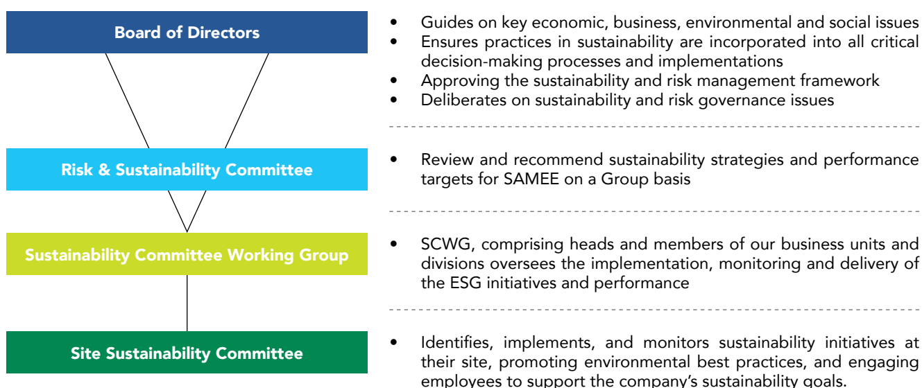
Figure 2: Sustainability Governance Structure of SAMEE

The sustainability pillars form the foundation of SAMEE Group's Sustainability Policy ("Policy") and we focus priority on governance considerations to reinforce our commitment to sustainability. The focus is on integrating economic, environmental, social and governance elements into our daily operations while coordinating our actions with sustainability objectives in mind. In terms of approach and efforts, we ensure that all our internal stakeholders are aware of our commitment to sustainability. For this reason, we have integrated our sustainability approach and initiatives into our orientation programme for our new employees to ensure we have a consistent and shared understanding of the sustainability initiatives and measures embraced by SAMEE. We promote our sustainability principle and practices among our leaders, internal and external stakeholders to achieve our sustainable goals.